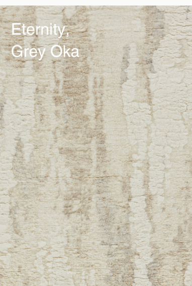
Eternity, Grey Oka