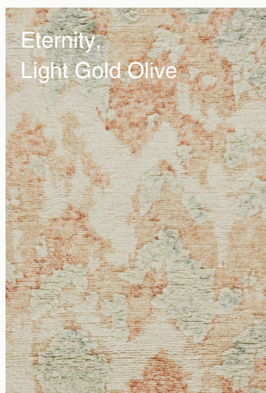
Eternity, Light Gold Olive